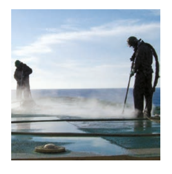
PREMIER TECHNOLOGY OVER HYDROBLASTED SURFACES

Lower surface preparation costs compared to abrasive blasting. Environmentally responsible.